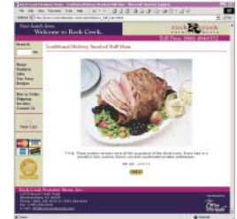
Rock Creek Meats